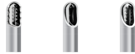
Saw Blade Full Radius Blade Half Saw Blade