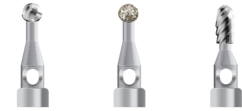
Round Burr Diamond Burr Oval Burr