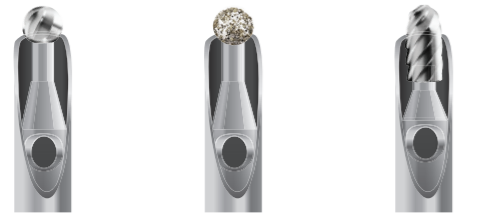
Round Burr Diamond Burr Oval Burr